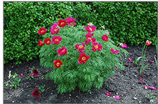
Fernleaf Peony in bloom