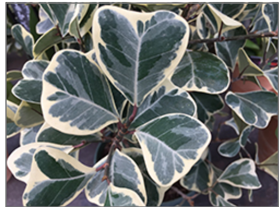
Variegated Triangle-leaved Ficus foliage