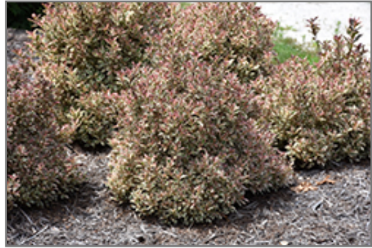
My Monet Weigela

My Monet Weigela makes a fine choice for the outdoor landscape, but it is also well-suited for use in outdoor pots and containers. It is often used as a 'filler' in the 'spiller-thriller-filler' container combination, providing a mass of flowers and foliage against which the thriller plants stand out. Note that when grown in a container, it may not perform exactly as indicated on the tag - this is to be expected. Also note that when growing plants in outdoor containers and baskets, they may require more frequent waterings than they would in the yard or garden. Be aware that in our climate, most plants cannot be expected to survive the winter if left in containers outdoors, and this plant is no exception. Contact our experts for more information on how to protect it over the winter months.