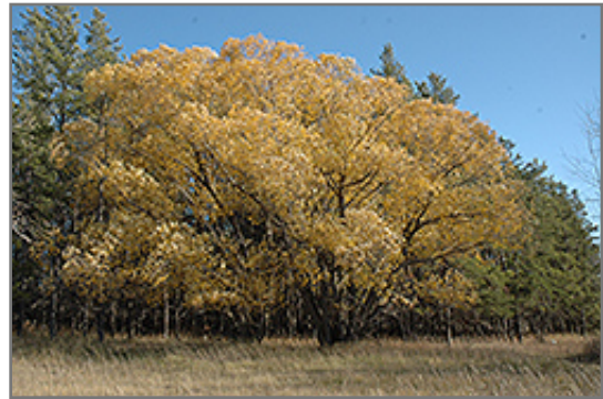
White Willow in fall