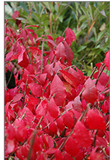
Burning Bush (tree form) in fall