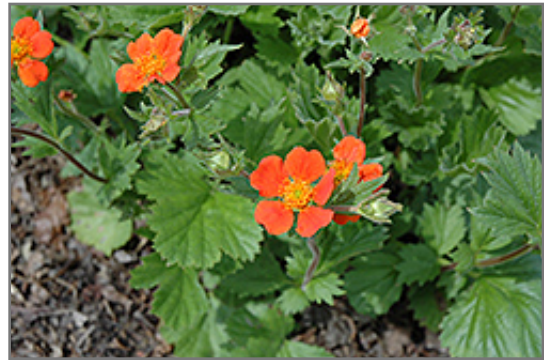
Boris Avens flowers

Boris Avens is recommended for the following landscape applications;