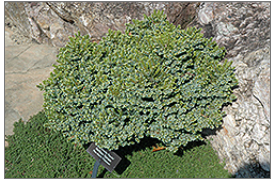
Pimoko Spruce