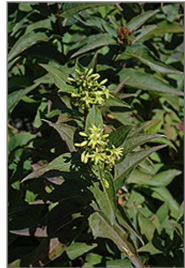
Butterfly Southern Bush Honeysuckle flowers

Butterfly Southern Bush Honeysuckle is recommended for the following landscape applications;