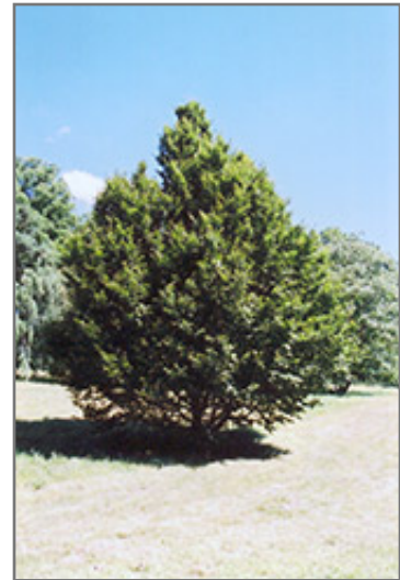
American Hornbeam

The American Hornbeam is recommended for the following landscape applications;