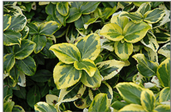
Gold Prince Wintercreeper foliage